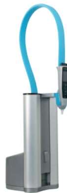
PURELAB flex 1