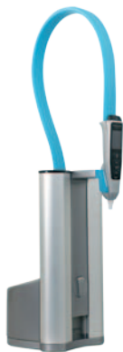
PURELAB flex 2