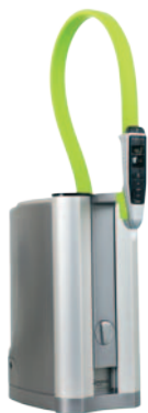
PURELAB flex 3&4